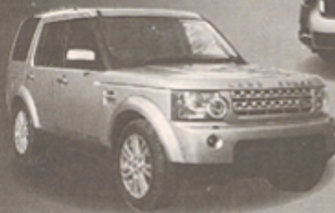
Land Rover LR4

2010 Land Rover LR4 or 2010 Jaguar XF or 2010 Volvo XC60 or $10,000 Cash