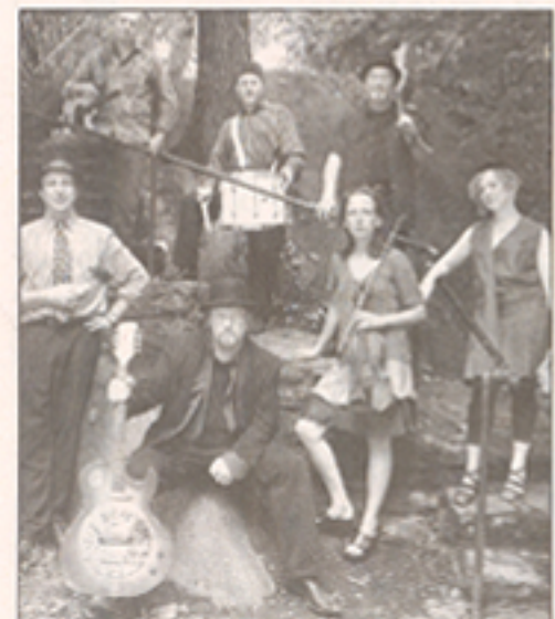
Spuyten Duyvil brings an important spirit of folk music to the Chapin stage from 6:15-7 p.m. on Saturday.