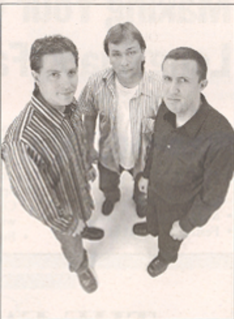
Enjoy the contemporary sounds of The Blur Division from 3:15-4 p.m. on Saturday.

Anyone interested in experiencing an afternoon of innovative contemporary music is invited to attend this performance of New York-based trio The Blur Division. The band is certain to once again demonstrate the limitless possibilities of three exploratory musicians getting together to craft their own original compositions which reconcile history with the future, tradition with technology, and jazz with a unique approach that resists categorization.